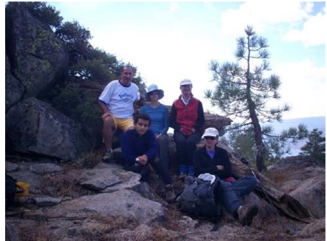
Summit Group Picture