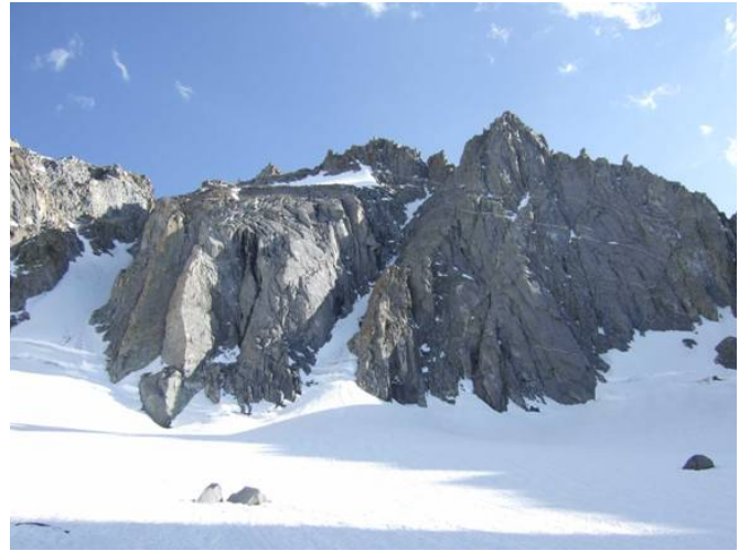
The North Palisade and Starlight Peak. Starlight Buttress is just right of the middle snow couloir.