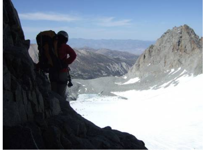
The end of the day. Linda Sun waiting to rappel the bergshund.

We used double 60 meter rope systems. This was unnecessary for the climb but was handy for the rappels. We way over racked for this route but were anticipating at worst case having to climb the butte directly which is about 5.9.