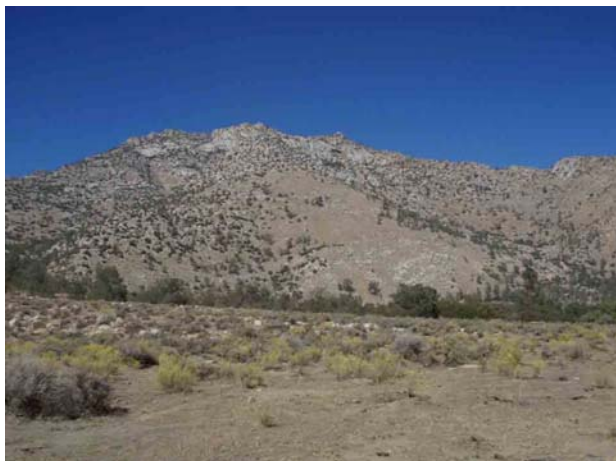
Pilot Knob from the South

Detailed directions: From Bakersfield, head east on Hwy 178 past Lake Isabella. In the town of Onyx, turn left at the sign for the Onyx Ranch Road (Doyle Ranch Rd). Park your car just before the creek (S. Fork Kern River), cross the bridge. We saw a ranch hand (cowboy) who gave us permission to go onto the private property. On the right hand side, there's a tubular metal gate, you can squeeze thru the gate and go down a dirt road for about 1.6 miles. You will pass a motley collection of trailers (and some dogs that will bark but are friendly), parallel a small creek on the N side of the road, go around a butte to the north, staying on the road all along, and then come to open ground where you can see the peak.