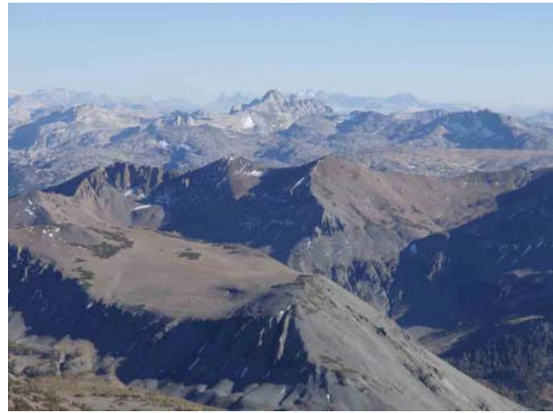
Tower Peak and Beyond from Leavitt Peak

We took off as soon as we could with no clear plan where to go. It was beautiful - crystal clear - around Tahoe and down 395. At Hwy 108, Jim turned up toward Sonora Pass. I had suggested climbing Leavitt Peak, which we did, starting about 1 pm. We followed the PCT until it dropped into a bowl to skirt a sub-peak. We left the trail and climbed the ridge to near the summit, then traversed toward Leavitt Peak. We climbed an extra 250 feet by taking this route. Though the traverse was somewhat exposed class 1, there was a fixed rope! We chose to take the "use" trail to the top due to the late hour, but the 3rd ridge to the right certainly looked inviting. The view from the top was spectacular.