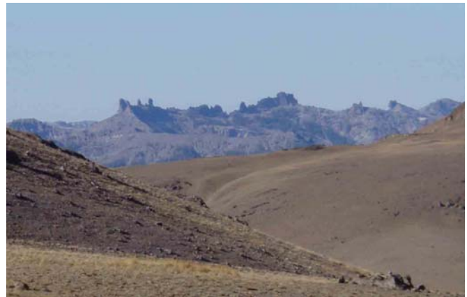
View from Trail to Stanislaus Peak

Rather than struggle with trying to find a campsite in one of the campgrounds in the dark we drove back to the pass and put up our tent in a non-campsite. After a late start we hiked up the Saint Mary's Pass trail and continued on the trail to Stanislaus Peak.