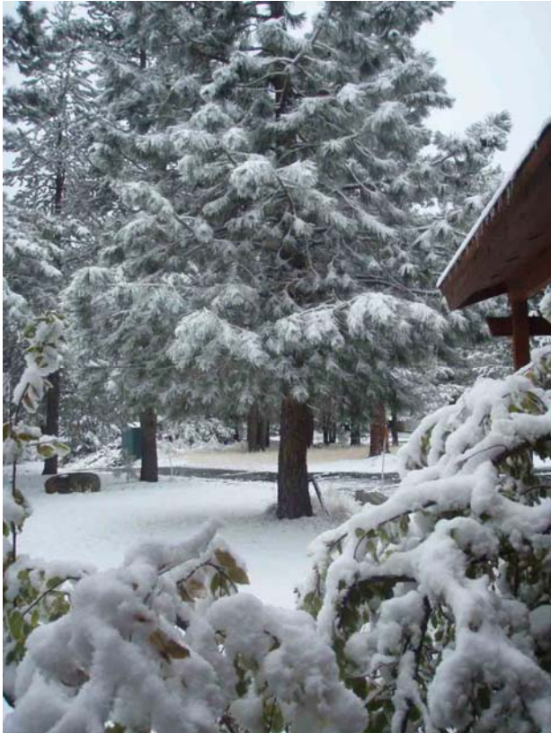
September Snow in Truckee

For this weekend Jim wanted to race around Tahoe on his bike on Friday, then go climb. The weather forecast did not look promising for mountain climbing, as it called for a storm with a snow level at 8000 feet to start at about 8 pm Friday. In the morning we awoke to 3 inches of fresh snow at 5800 feet and overcast skies.