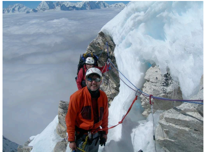
Ridge between C1 and C2

In the end, a route to the left was established and fixed and after two days of rest we left for the summit. On the first day we hiked up to C1 gaining about 4000 ft from the base camp. Two guys from our party of four (not counting guides/sherpas) decided that this is going to be their high point. On the second day we climbed a beautiful rocky ridge with occasional snow patches to C2. Seemed liked it was low fifth class with tremendous exposure on both sides. Right before C2 we climbed the yellow tower - most technically difficult part - rated 5.7 or 5.9 depending on the source. At 19000+ ft it was very demanding especially in plastic boots.