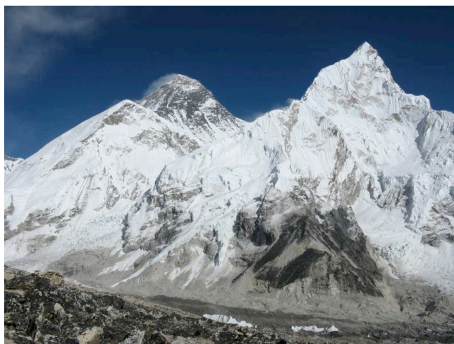
Everest and Nuptse

From there we hiked up to Kala Patar (18200) - we had great views of Everest, Nuptse, Lhotse and Khumbu Icefall. Next day we hiked to Everest base camp - at this time of the year there were just a few expeditions. From the base camp, the icefall seemed like an enormous puzzle made up from gigantic ice pieces.