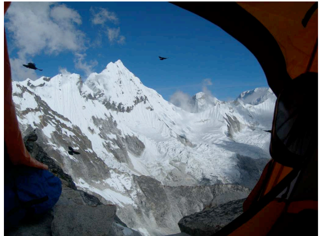
View from C2