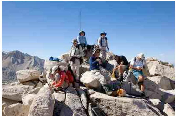
PCSer's and OPCer's at Candlelight Peak