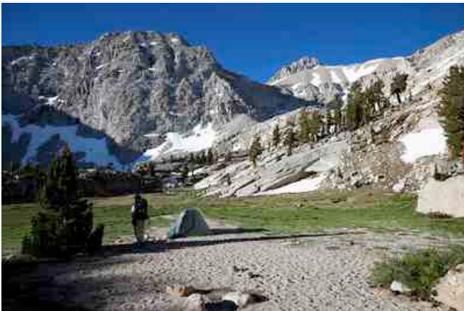
A perfect campsite

Getting up to the lakes in the basin proved a bit of a 'schlep', as the trail covered 3000+ vertical feet in around 4.5 miles. Views back toward the Owens Valley were predictably stunning. Views ahead improved as we worked our way up, revealing a lovely granite basin with several prominent peaks. Despite the heavy snow year, there was little snow save a few large areas in the upper part of the basin.