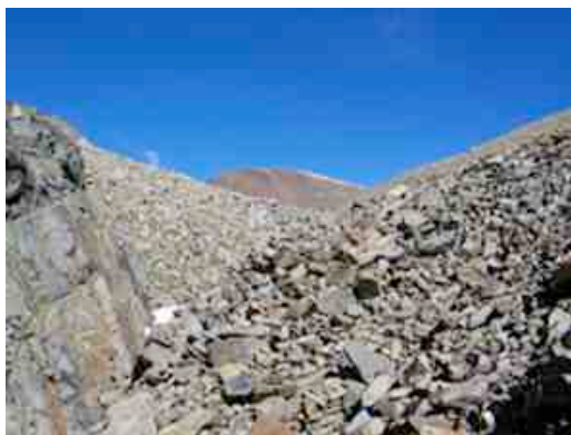
First view of the peak climbing up from the meadow, 1,600 feet of this busted rock. Ugh!