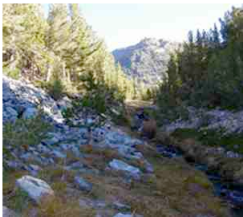
The creek leading from Warren Canyon to the meadow

The main attraction of the mountain appears to be the excellent view of Mono Lake. The mountain is closer to the lake than Mt. Dana which is visible to the southwest and which is higher at 13,057 feet. Alan and I climbed Mt. Dana on the Fourth of July, 2003, so I have seen the view from both mountains, and the view, at least of the lake, is better on Warren.