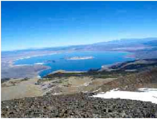
Pretty much the point of the whole climb: Mono Lake, 4 ½ miles to near edge. The lake itself is 12 miles across