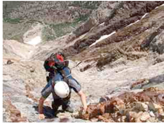
Julius climbing the class-4 with Convict Lake behind

Somewhere, mid-mountain, maybe half way up, the gully ended and dropped us onto a muddy plateau. We surveyed the terrain, compared it against the map and photos from Bob Burd's report and headed up on some red slabs. There were loose parts here but it was not too steep and at the maximum, no harder than easy class-3. We continued till Julius decided to veer left and we saw a large open gully and deduced that we were off route. To get back on, we thought that we would have to traverse some very sketchy terrain, go over a rib and maybe the real gully (class-2) would be behind. But above us was a long and wide expanse of very solid looking slab terrain with what seemed to be a dyke running through (shades of the Snake Dyke on Half Dome). We looked at each other. This was decision time. The traverse was unappealing with an unknown gully beyond which, at best, would be horrible, scree-filled class-2. "What the hell, let us try these slabs", suggested Julius and we started climbing. This seemed to go on forever and we were doing moderately steep climbing on solid slabs and - at least three or four times, I remember making solid 4th class moves and some of them even low 5th. But the climbing was always solid and safe and we never felt the need for a belay. Smearing worked very well and neither of us even needed our rock shoes.