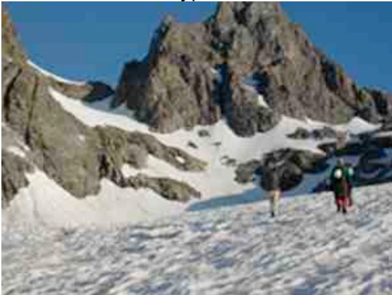
Approaching the glacier leading to the saddle

Up a short slope left of a creek flowing out of the glacier above and we were on snow, moderately sun-cupped. There was a lot of red snow surface in the basin. This is sometimes call "watermelon snow" because up close it smells faintly of fresh watermelon. It is actually due to an algae called Chlamydomonas nivalis . Apparently Aristotle was the first to write about it. Anyway, it is common in the Sierra Nevada during the spring melt-out (and in Colorado too). It is said to be toxic, causing diarrhea if eaten or the snow melted and drunk. I've never tested this hypothesis.