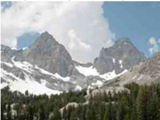
Mt Ritter and Banner Peak above Ediza Lake