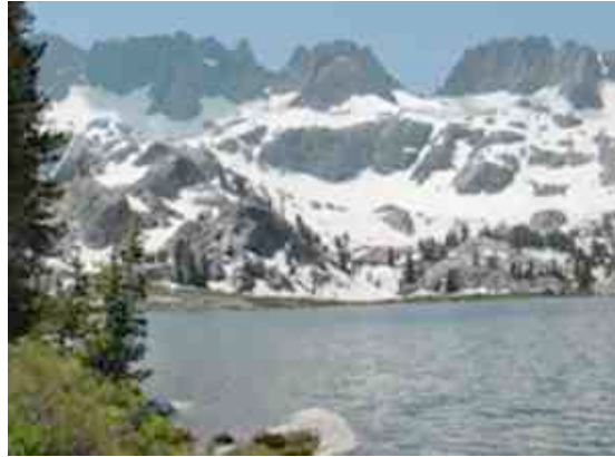
Minarets from Ediza Lake

around the southern side of this lake to a bench about 400' above its western end and a camp site at the edge of a wet meadow surrounded by snow, rushing water, and a glacier-polished rock outcropping.