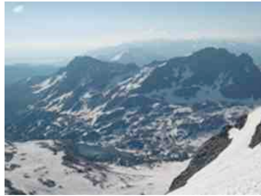
Volcanic Ridge across Ediza Lake from just below the saddle

The peaks are separated by a saddle at around 12,000' with a small glacier below it and rock bands above and below separating the glacier from the saddle and the lower glacier respectively. A narrow couloir leads through the upper rock band which this year in July was filled with snow. Our route to the saddle was to weave through the rock bands on snow. The top of the couloir had a short steep headwall of about 50-60 degrees of firm snow (not quite ice yet). So the finish getting up to the saddle was exciting, but easily handled by everyone.