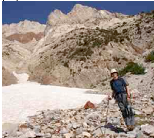
View of Gully with snow coming out

The red rocks inside the gully at this point are amazing to look at. The gully is a thin cleft in the rock and it snakes up. We were offered some fun climbing on the rock here. It was mostly class-3. There were some places, too many to describe, where there was a steady stream of water trickling down the gully, bang in the middle of the route that we had to climb. Normally, one avoids climbing in the path of water, especially the 4th class sections and some even low 5th for the usual reasons: boots not getting good purchase and the chance of moss on the rock, adding to the slickness. However there was no moss at all and our feet held positively on the wet rock.