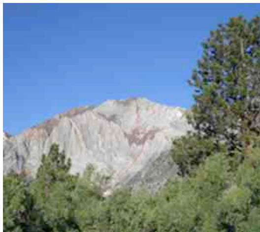
N Face of Laurel with our route

The approach is well described in Bob Burd's description on the web and it makes finding the route a relatively easy proposition. The north face of Laurel is a complete revelation as seen from Convict Lake. From Highway-395, Laurel looks like a hill of modest proportions, hardly worth a second glance, but from Convict Lake it presents an impressive visage. Wonderful striations, colors and bands mark its wide face and you have to look closely to find any climbable weakness therein.