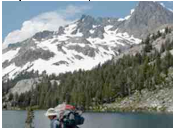
Ediza Lake with Mt Ritter looming above